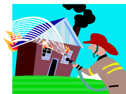
Fire Fighters Wanted!

Rate of pay: As much as you can take away in your heart. The truly worthwhile things in life will cost you something. There is a stipend, as well!